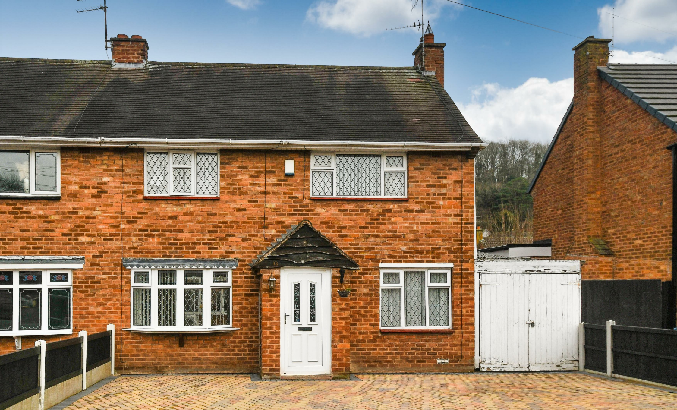
13 Meadow Lane, Wombourne, Wolverhampton, South Staffordshire, WV5 9BT